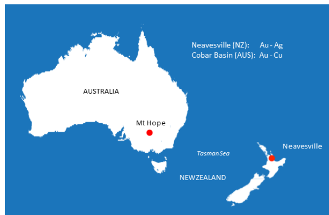
E2 Metals Project Locations

The Neavesville Project contains three principal target areas, Neavesville, Oneura and Chelmsford. The Neavesville target area contains six known prospects, with the two most advanced being the Trig's Bluff Deposit and the Ajax Prospect. Work conducted at Neavesville includes 63 diamond holes totalling more than 8,900 metres of drilling; 1,400 rock samples, soil sampling grids and geophysical surveys.